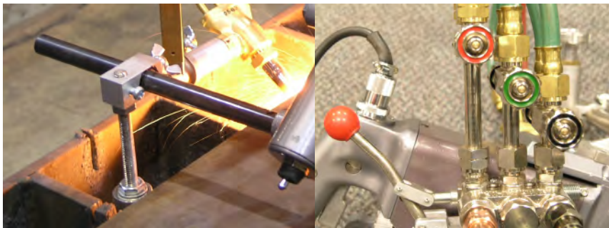
Tracer Guide Roller