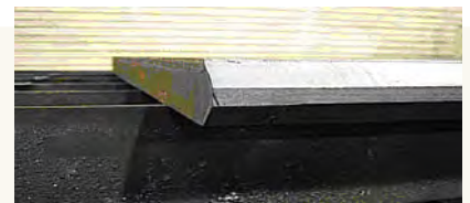
Detail Double V-Groove

Designed in cooperation with the shipbuilding industry to meet the need for simple, yet effective plate edge preparation. The Edge-Cut ® performs high quality single or double bevels with out the need for a track. V-Grooves essential to full penetration welds can be performed with just one pass. Ease of set up and constant speed ensure high quality cutting even during long distant cutting. The Koike Snap Valve allows pre-setting of flames to reduce set up time while reducing gas waste.