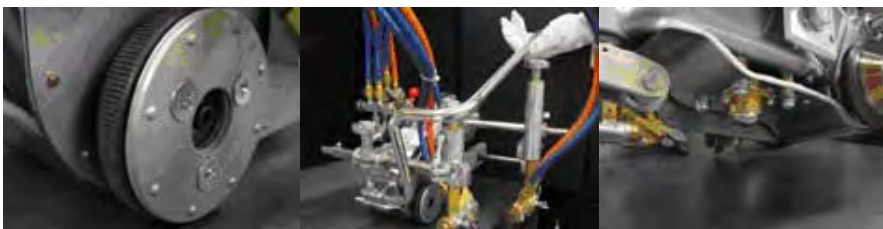
Heavy Duty Heat Shielding