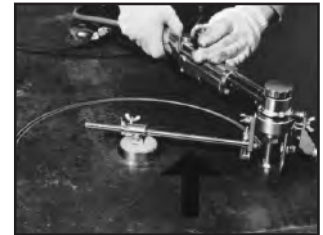
Extra large circle cutting attachment 120-1000mm (5-40 in)