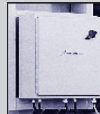
NEMA 12 Electricals include dust tight enclosures and push button pendants.

Note: Variable Speed Options have Rapid Traverse and Inching features.