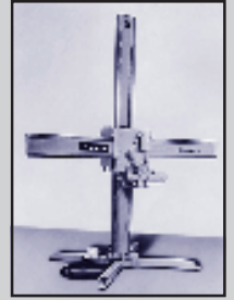
Locust-1 series offers three different size models with load capacities of up to 400 pounds.