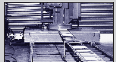
Kingpin Car and Track with cable carrier options.

Note: Variable Speed Options have Rapid Traverse and Inching features.