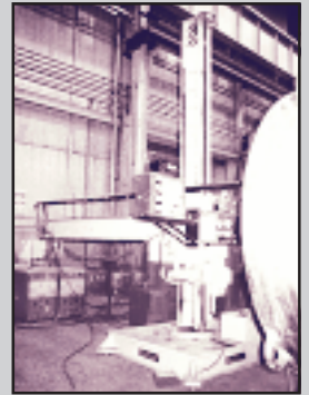
Scarab-II heavily equipped for overlaying power generation components.