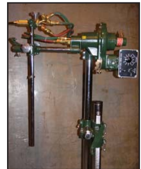
Inclined Plate Cutting

The specially designed stand allows stability and flexibility in the field. Vertical position is easily obtained by turning the handle on the stand. Cutting precision can be achieved from 0-45° inclines by adjusting the arm joint to ensure torch position.