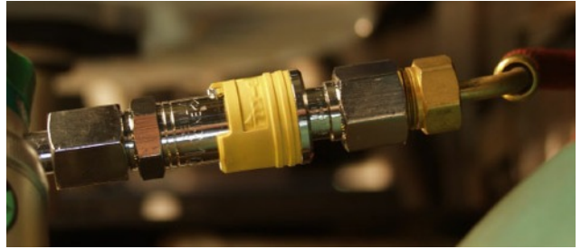
Regulator to Hose