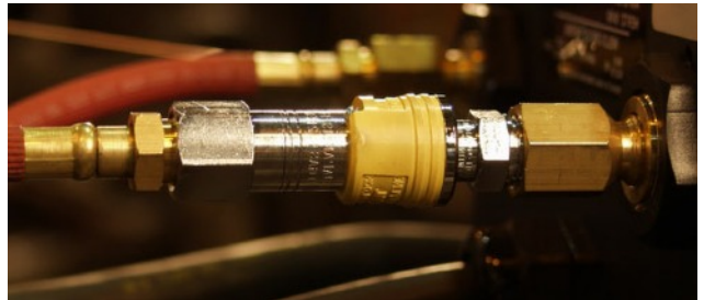
Hose to Equipment