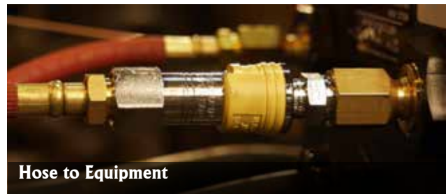
Hose to Equipment