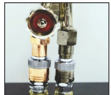
Safety-Z and Super Sentinel Coupling Sets