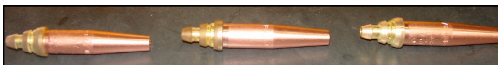
KOIKE Cutting Tips