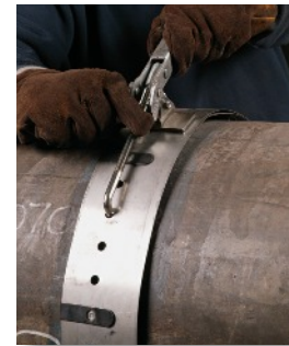
Adjusting Chain Links for Various Diameters