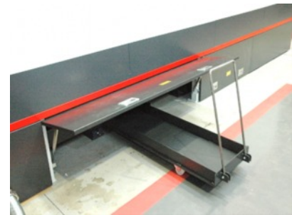
Slag Removal Bucket

The fiber laser resonator structure is simple and provides extremely efficient oscillation. It is able to reduce maintenance costs by fewer external optical devices and decreases the electric power use by 70% compared with the CO 2 laser. It can reduce the total running costs more than 50%. Thus, good economic efficiency, power conservation and CO 2 emissions reduction becomes possible with the new fiber laser machine FIBERTEC.